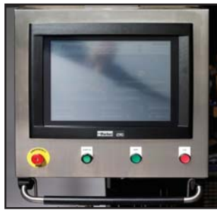
Rear Auxillary Control Panel