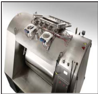
Canopy additions such as Ingredient door, liquid and/or dry ingredient inlets, canopy scraper